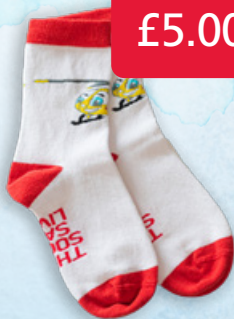
White Socks Children Size 9-12

Also see pages 10-11 of this issue of Lift off for more ways you can save lives this Christmas.