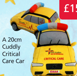
A 20cm Cuddly Critical Care Car