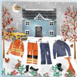
Wash Day 126mm x 126mm