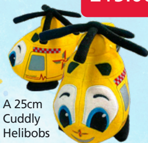
A 25cm Cuddly Helibobs