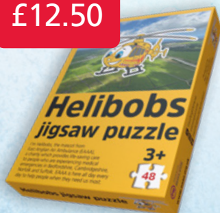
Children's Jigsaw EAAA 48-piece