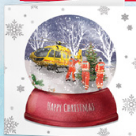
Snow Globe 126mm x 126mm