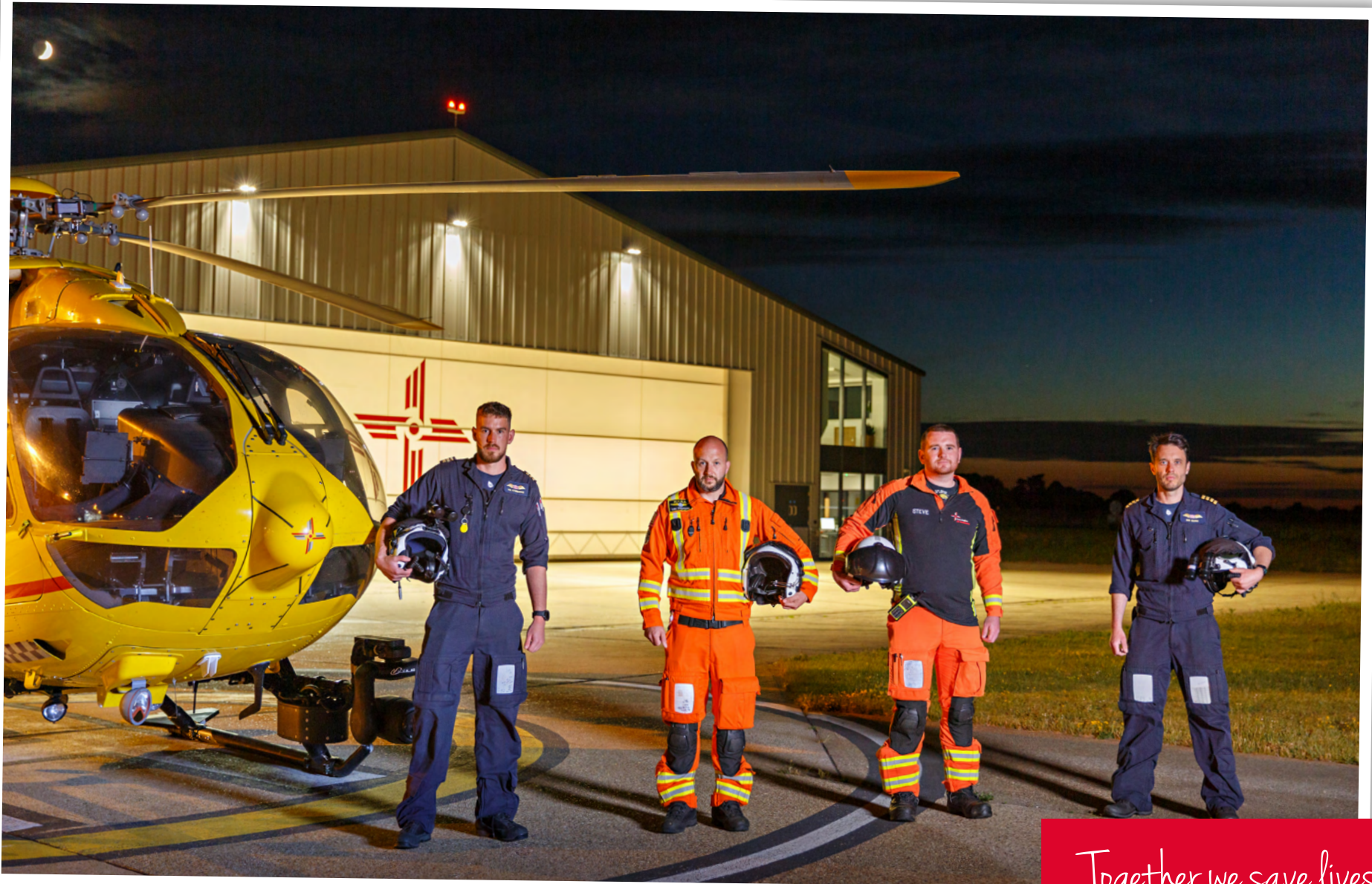
Together we save lives