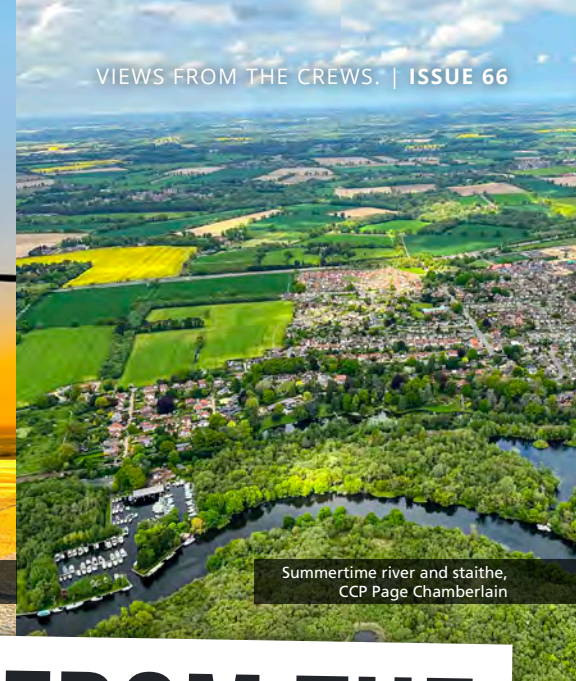
Summertime river and staithe, CCP Page Chamberlain