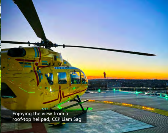
Enjoying the view from a roof-top helipad, CCP Liam Sagi