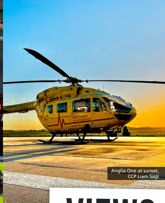
Anglia One at sunset, CCP Liam Sagi