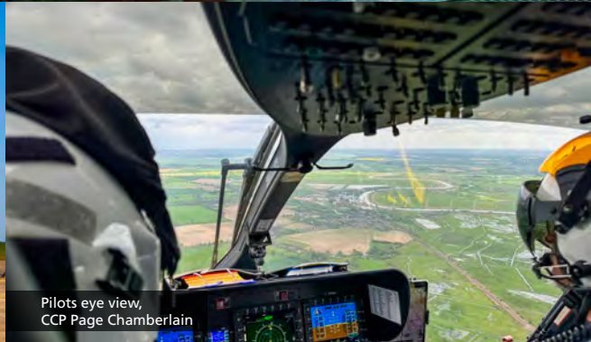
Pilots eye view, CCP Page Chamberlain