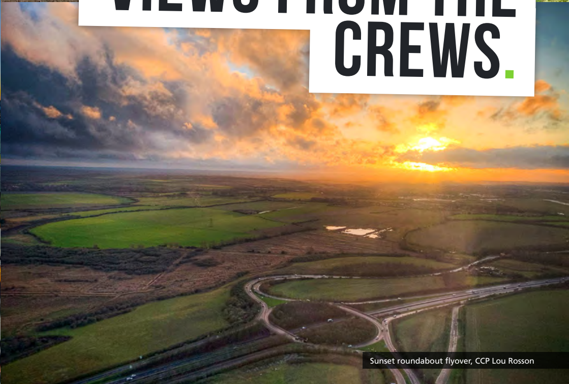
Sunset roundabout flyover, CCP Lou Rosson