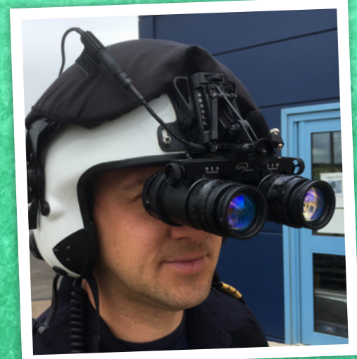
View through the goggles

We have recently received new Night Vision (NVIS) goggles, which have taken our pilots into a new era of night vision technology. On the darkest nights, we have gone from looking at a world of green to a clear, sharper, monochrome picture.