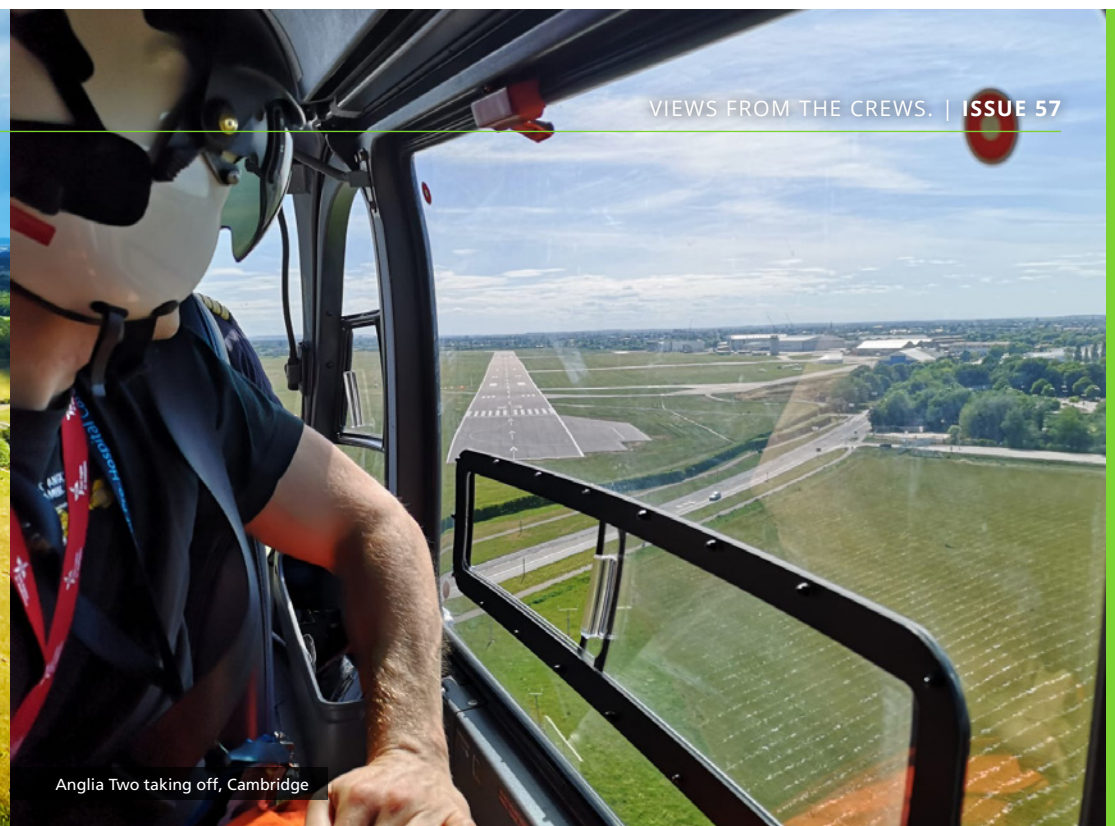
Anglia Two taking off, Cambridge