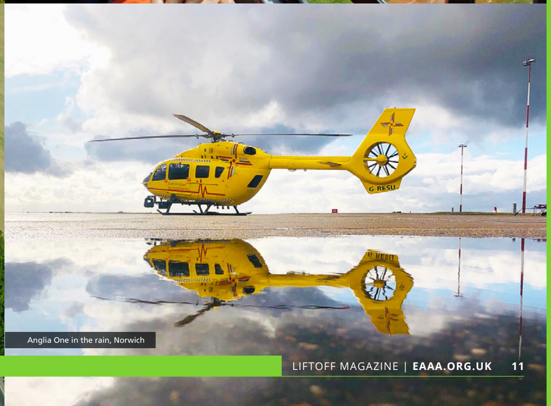
Anglia One in the rain, Norwich