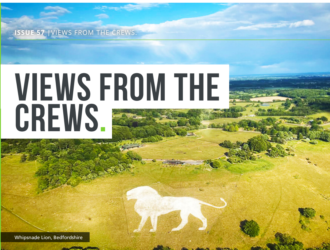
Whipsnade Lion, Bedfordshire