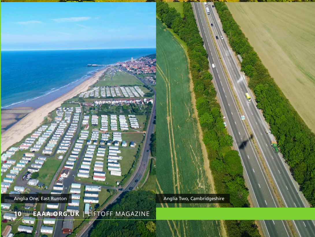
Anglia One, East Runton